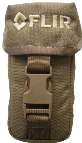
Molle-Compatible Belt Holster