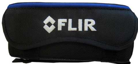
Camera Carrying Pouch