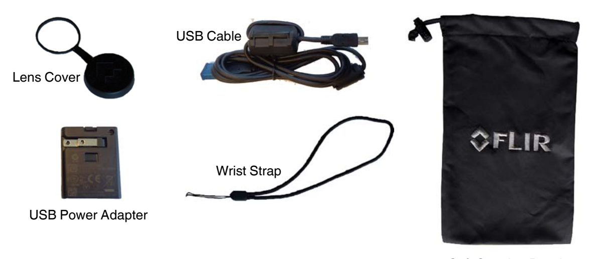
Soft Carrying Pouch

In addition to the camera, Quick Start Guide, and Documentation CD; the following items are included in the camera package: