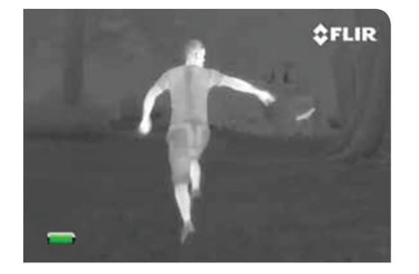
Assailant trying to dispose of evidence

No matter how clever a suspect may be, they can't hide their heat. Rather than rush on the scene with a flashlight that instantly gives away your position and only illuminates your immediate area, FLIR LS is just as portable, and exponentially more effective. Search the scene for discarded evidence in pitch black conditions where traditional night vision fails. You can see through smoke, dust and light fog. Even light foliage and camouflage are powerless against thermal imaging. Take away every hiding spot with FLIR LS Series.