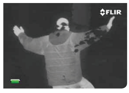
Suspect subdued and in custody

Visit www.FLIR.com/LSSeries for more information, including a product selector guide, interactive simulator, case studies, videos and more.